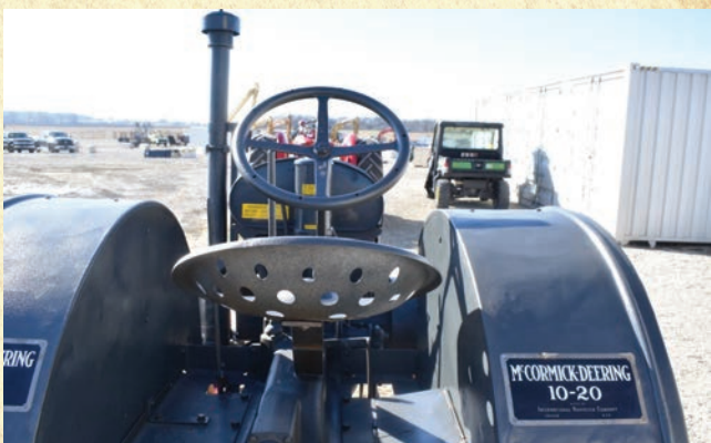
This is only a Partial List of the Highlights